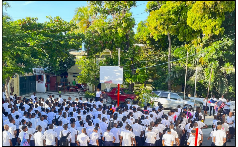
Louverture Cleary School students gather for morning assembly as LCS starts its 36th year!

class of Sizyèm (7 th grade) students gathered to participate in a new student orientation program facilitated by an incredible team of LCS staff and junior staff. The new students stayed on campus, became familiar with the daily routine, worked together, and even got their first taste of the school's four languages